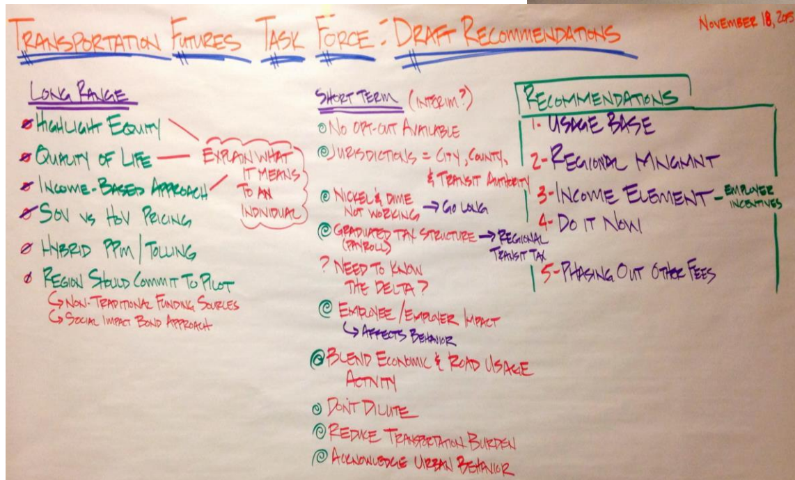
Figure 2: Wall graphic recorded during the meeting